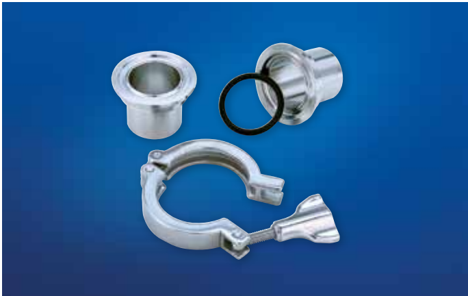
CONNECTIONS IN ACCORDANCE WITH DIN 11864

Safety for detachable connections Aseptic couplings with threaded, clamp or flange connections that comply with DIN 11864 are now the standard connections in tube systems for liquid media in the pharmaceutical industry and biotechnology. Dockweiler offers the components in this range of connections in various surface finishes to fit the tube system in question.